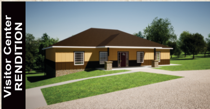
Visitor Center RENDITION